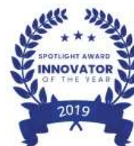
SPX Annual Awards