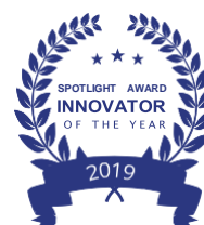
SPX Annual Awards