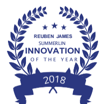
Pacific's Financial Inclusion Program