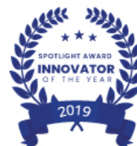
SPX Annual Awards