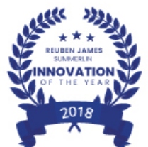
Pacific's Financial Inclusion Program